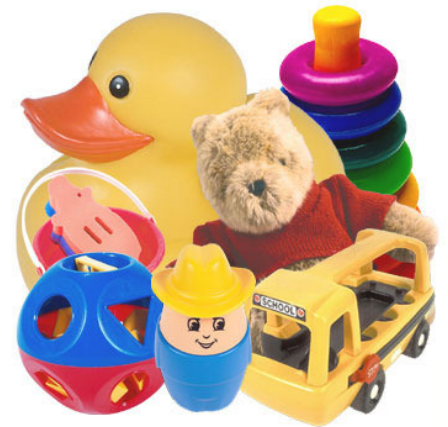
A collection of children's toys

http://www.cpsc.gov/cpscpub/prereel/category/toy.html