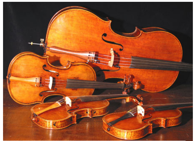
A quartet of string instruments